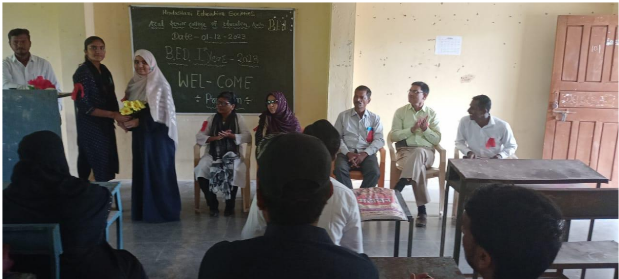
Wel-come programme organized BED SY students for BED FY Students on 01/12/2023