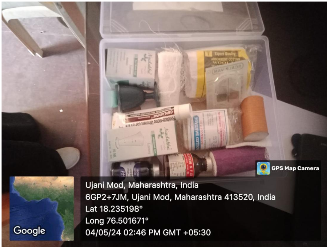
First aid and medical aid