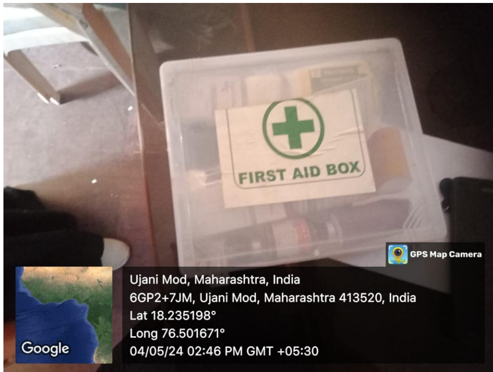
First aid and medical aid