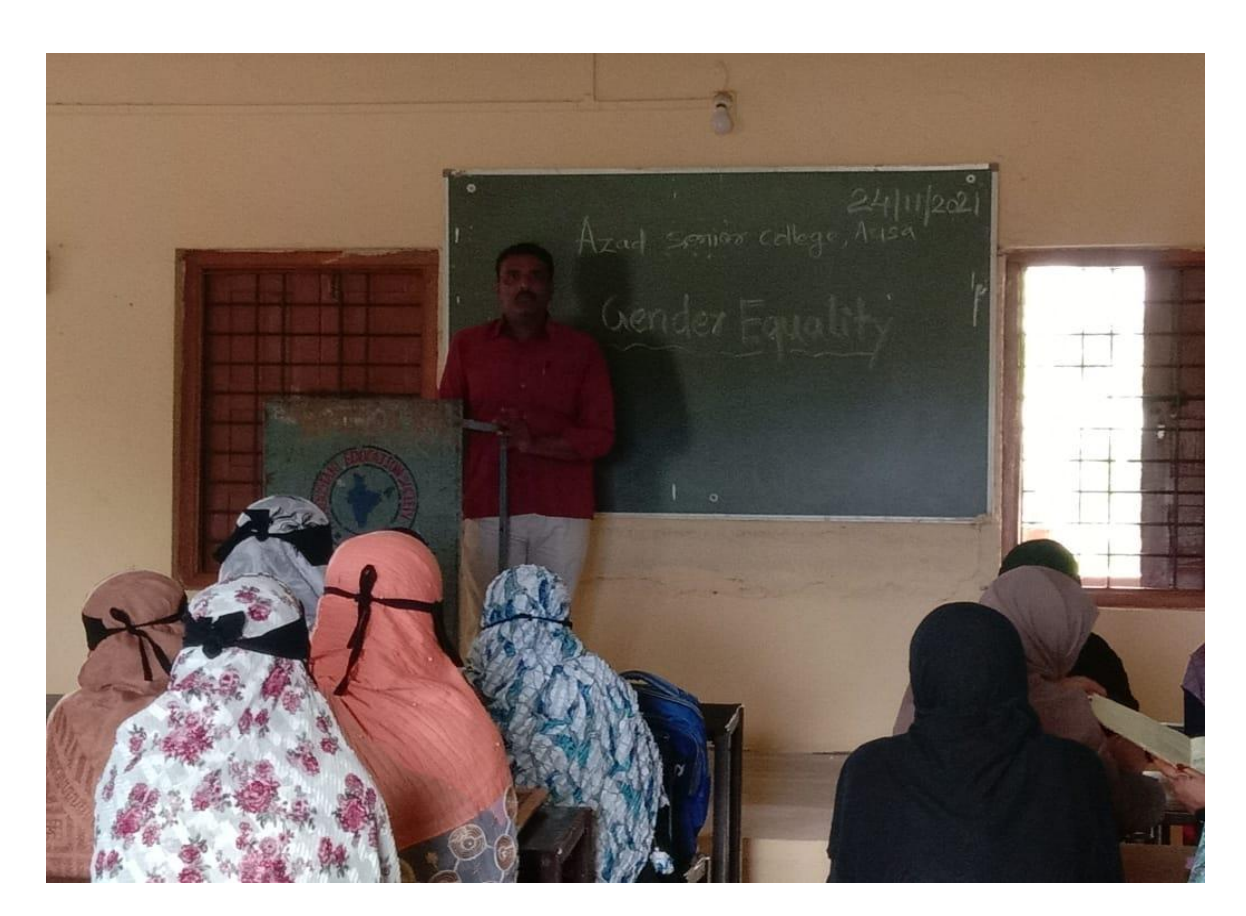
Gender Equality program