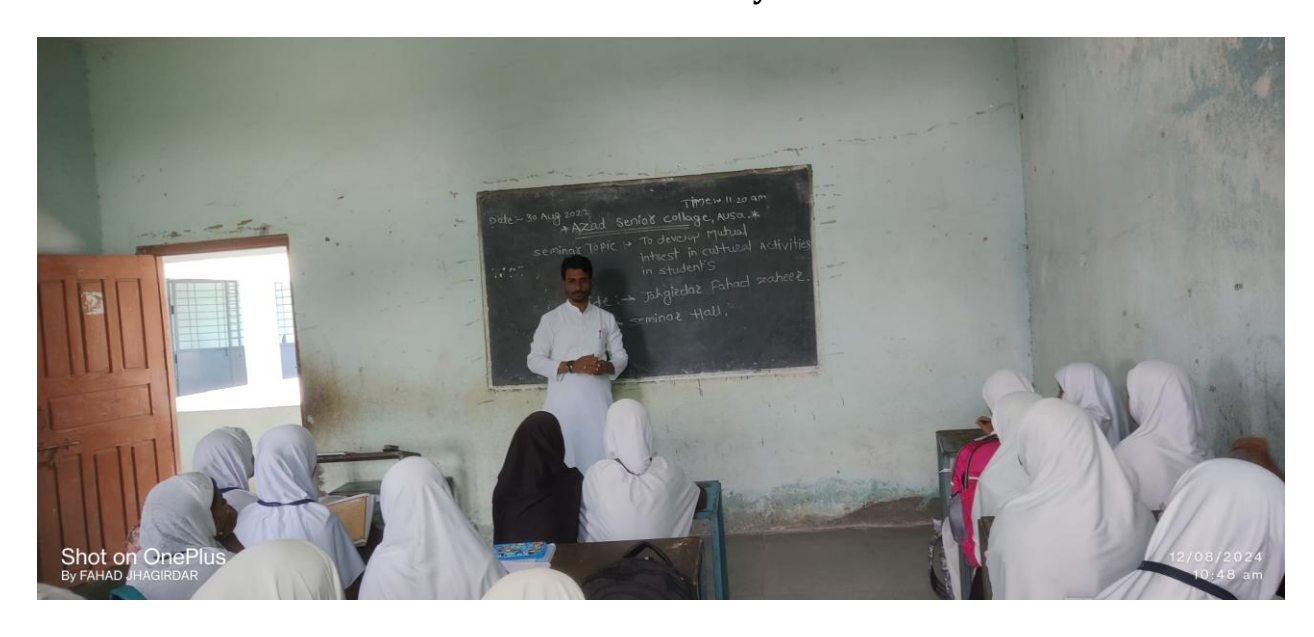
Event of mutual interest-discussion on school education