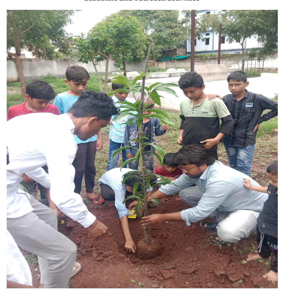
Tree plantation with school students

3.4.3: Institution has linkages with schools and other educational agencies for both academic and outreach activities