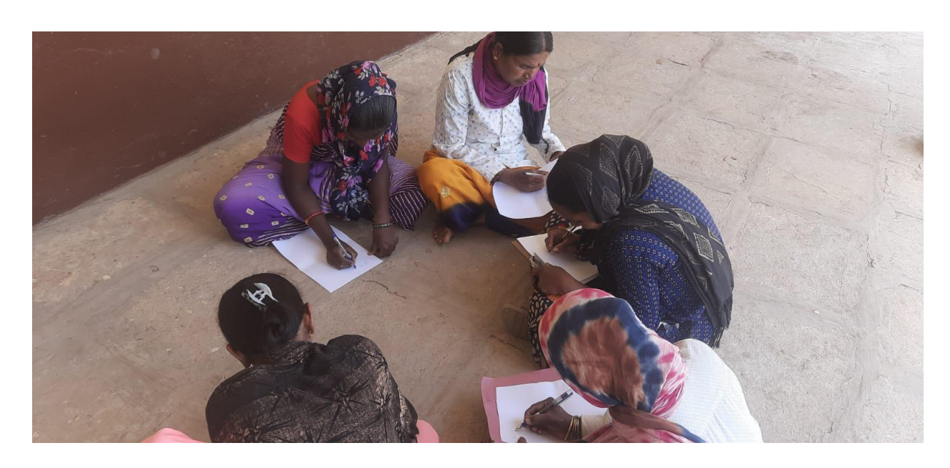
Program on women literacy