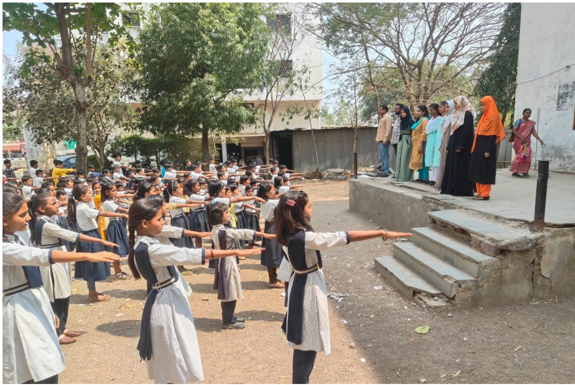
Prayer at school by internees