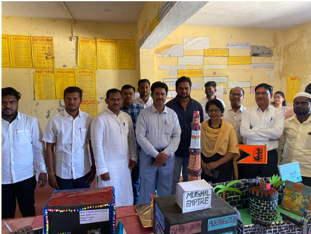
Charts and models prepared by students