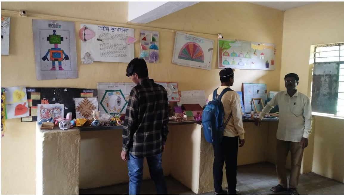
Charts and models prepared by students