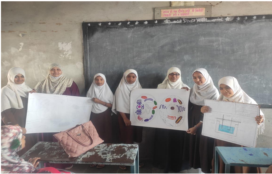
Charts prepared by students