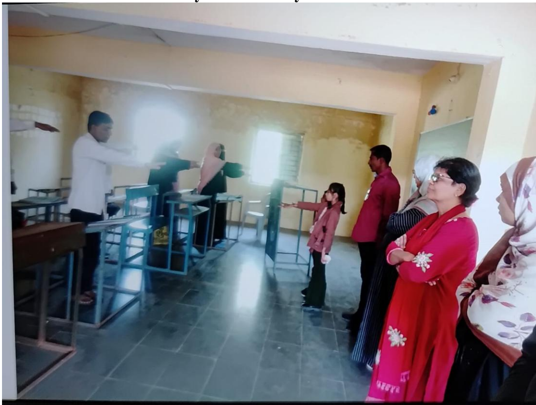
Pray in classroom