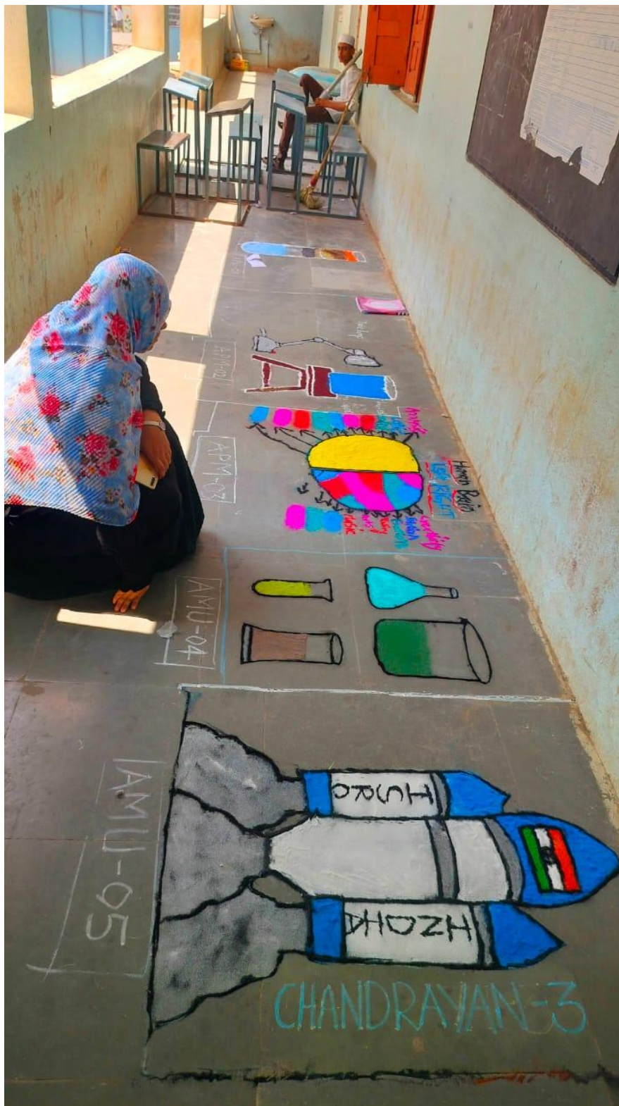
Trying for innovative ideas