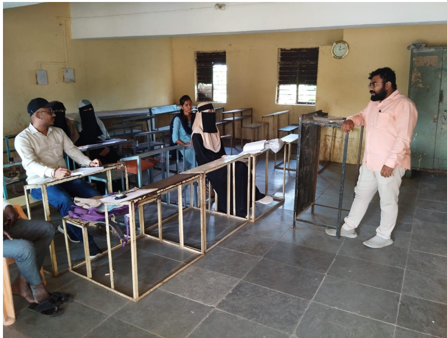
Inclusive Classroom teaching